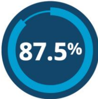
MALES WHO RECEIVED BONUS PAY