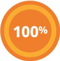
FEMALES WHO RECEIVED BONUS PAY