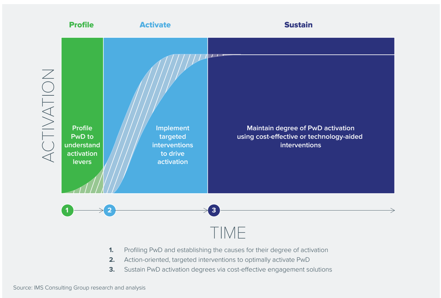
Exhibit 4: A PwD Path to Optimal Adherence and Persistence

In the 'profile' phase, PwD need to be assessed by HCPs to determine their degree of activation as well as the health-related attributes (including attitudes, motivations, behaviours and logistical challenges) that lead to this degree of activation. In the 'activate' phase, to effectively improve activation and successfully set PwD on the path to optimal adherence and persistence, interventions, goals and action steps need to be customised based on the individual's degree of activation. Finally, in the 'sustain' phase, PwD who have reached high degrees of activation and therefore proficient self-management behaviours in therapy adherence and persistence can be transitioned to cost-effective T2D management solutions.