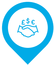
Changing profit drivers