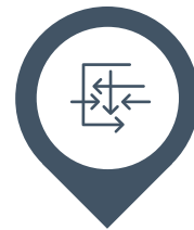
Increasing complexity and self-managed data costs