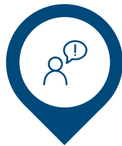
Payer and provider demands